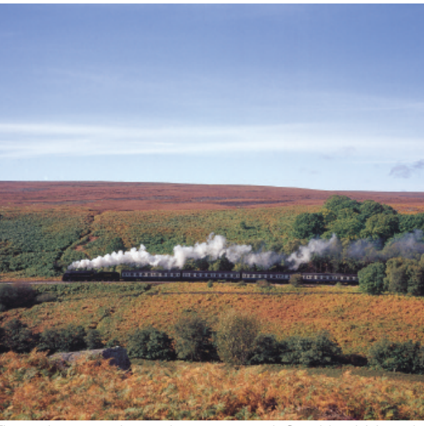
The train passes beneath an autumnal Goathland Moor in October 1991.