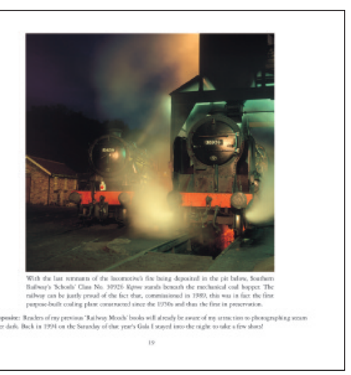
Example of a typical double page spread