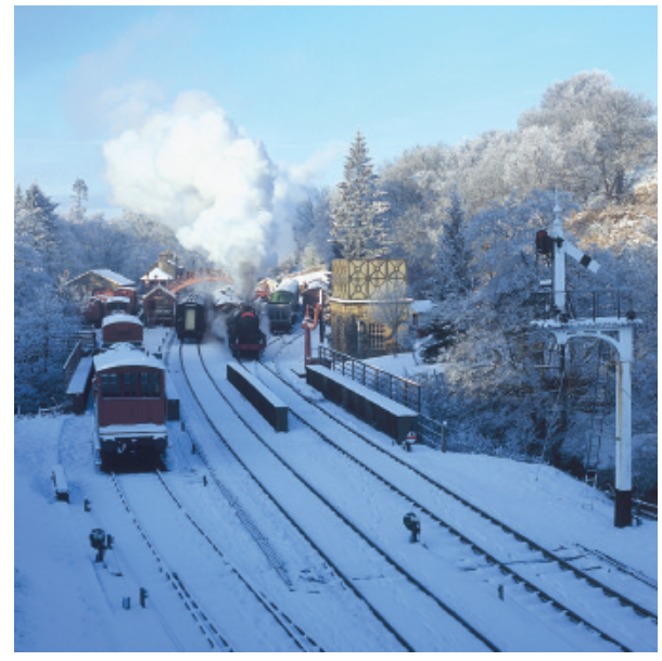
That day's 'Moorlander' dining train thundered into the station.