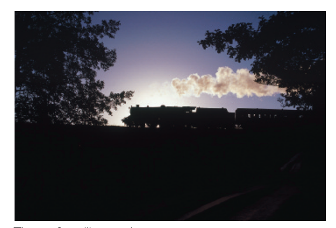
The perfect silhouette!